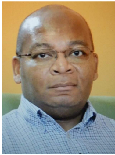
BY PONGA LIWEWE

Davies, through guile and prudent use of resources, built the Arthur Davies Stadium, adjacent to a disused airstrip in the Ndeke area of Kitwe. It was a simple